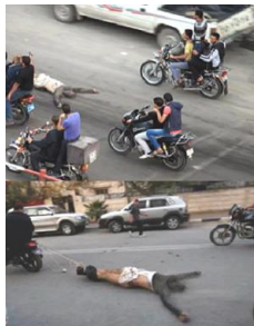
Corpse being dragged dragged through streets of Gaza

What the ISIS, ISIL or IS look-alikes have in common are intolerance of any religion other than Islam, fury at any hint of criticism or lack of respect for their religion, establishment of a caliphate, imposition of Shaaria law and most reprehensible of all, unbelievable cruelty.