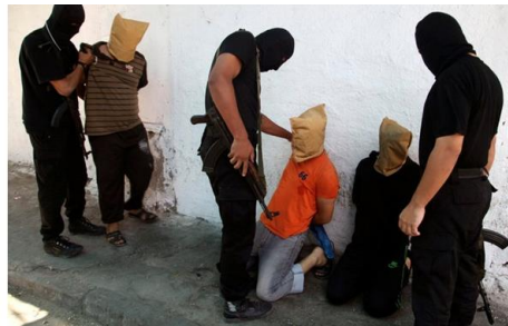
Gazans about to be executed

The pictures above show Hamas behavior closely matching that of ISIL. Recently, having executed over 30 Gazans a few weeks earlier, Hamas proudly showed films of the extra-judicial execution of a further 25 fellow Palestinians, including two women. In November 2012 the Guardian reported that masked Hamas gunmen publicly shot dead six suspected collaborators. A sixth corpse was tied to a motorcycle and dragged through the streets.