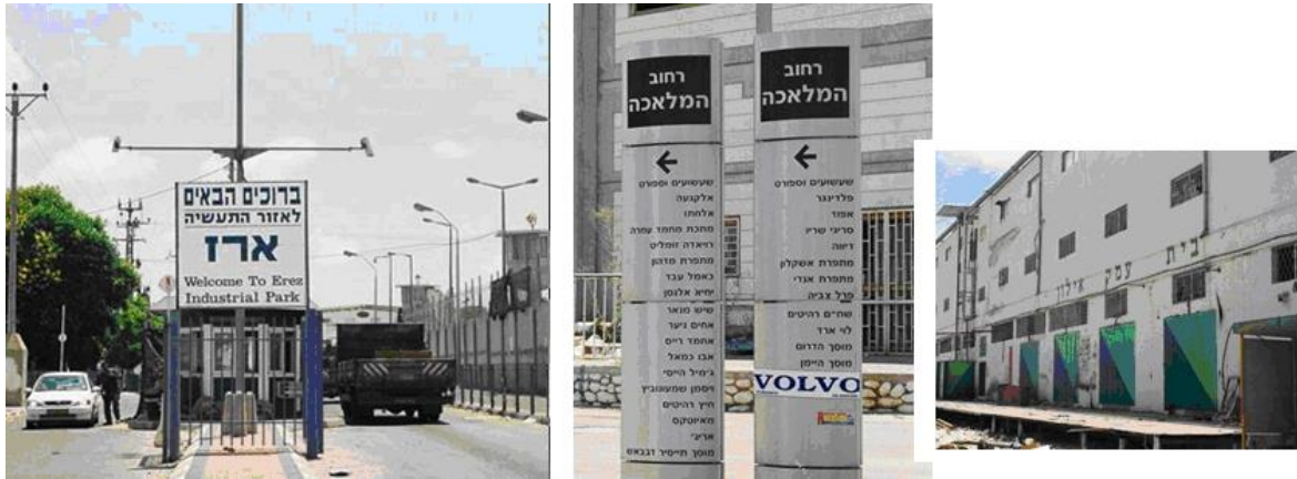
The Erez Industrial Park

produced everything from plastics to car parts and continued to do so even as the Israeli-Palestinian conflict raged. This was part of a larger Gaza Industrial Estate (GIE), slated to provide up to 50,000 jobs. In addition, a joint industrial zone was planned south of Tulkarm intended to provide jobs for more than 5,000 Palestinians. Additional areas were planned for Jenin and the Kerem Shalom area near Rafah in Gaza which were not given the chance to be realized