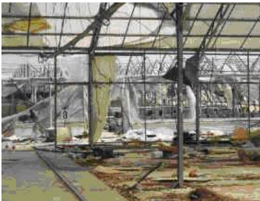
One of the destroyed greenhouses